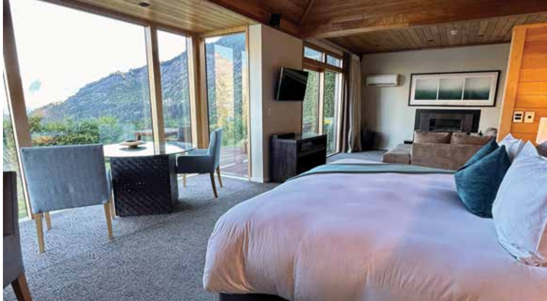
DREAMY VIEWS: Azur Lodge has nine private villas offering seclusion and views of Lake Wakatipu and the Remarkables Range.

Azur Lodge has nine private villas offering seclusion and dreamy views of the lake and Remarkables Range. Azur is a hilltop Shangri-La of tranquility, just a short drive to central Queenstown. Note: Soaking in a villa bathtub next to a large bay window with unobstructed vistas is a must. Contact GM Kylie Hogan at gm@azur.co.nz .