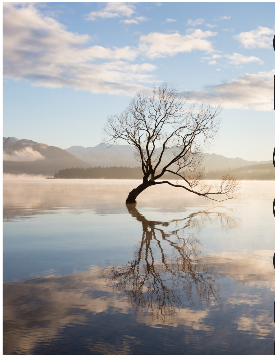
Editor-at-large Ignacio Maza uncovers off-season thrills while exploring New Zealand's most fascinating landscapes.