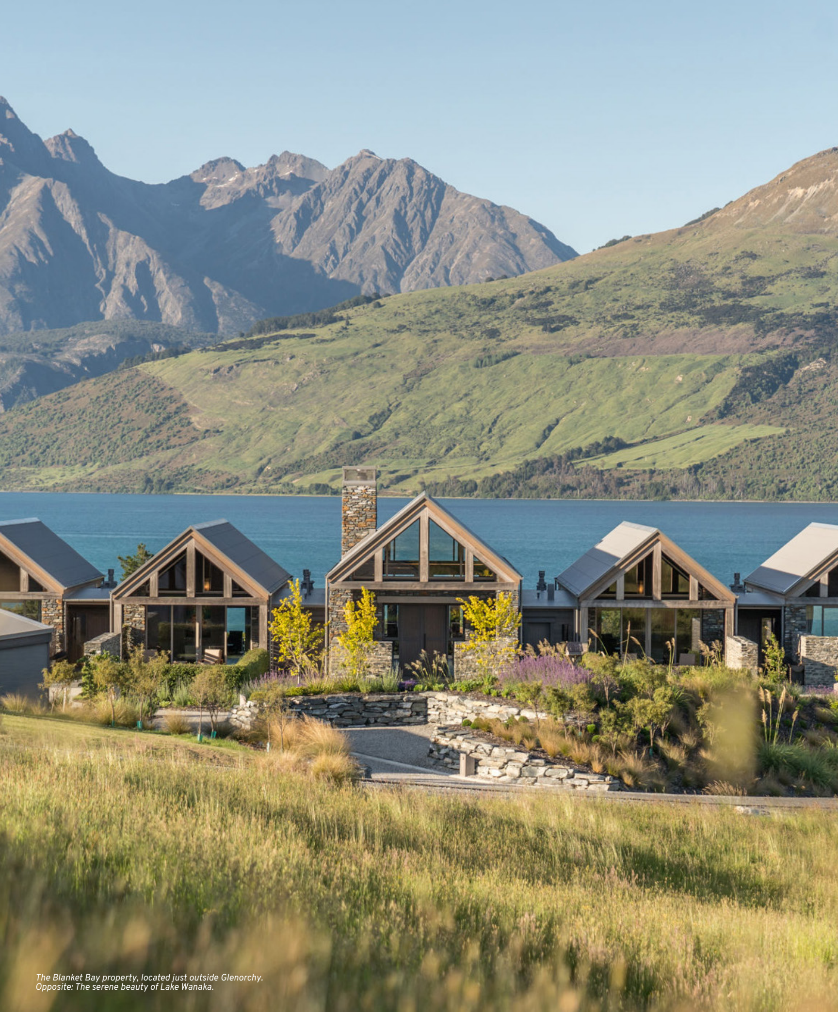
The Blanket Bay property, located just outside Glenorchy. Opposite: The serene beauty of Lake Wanaka.